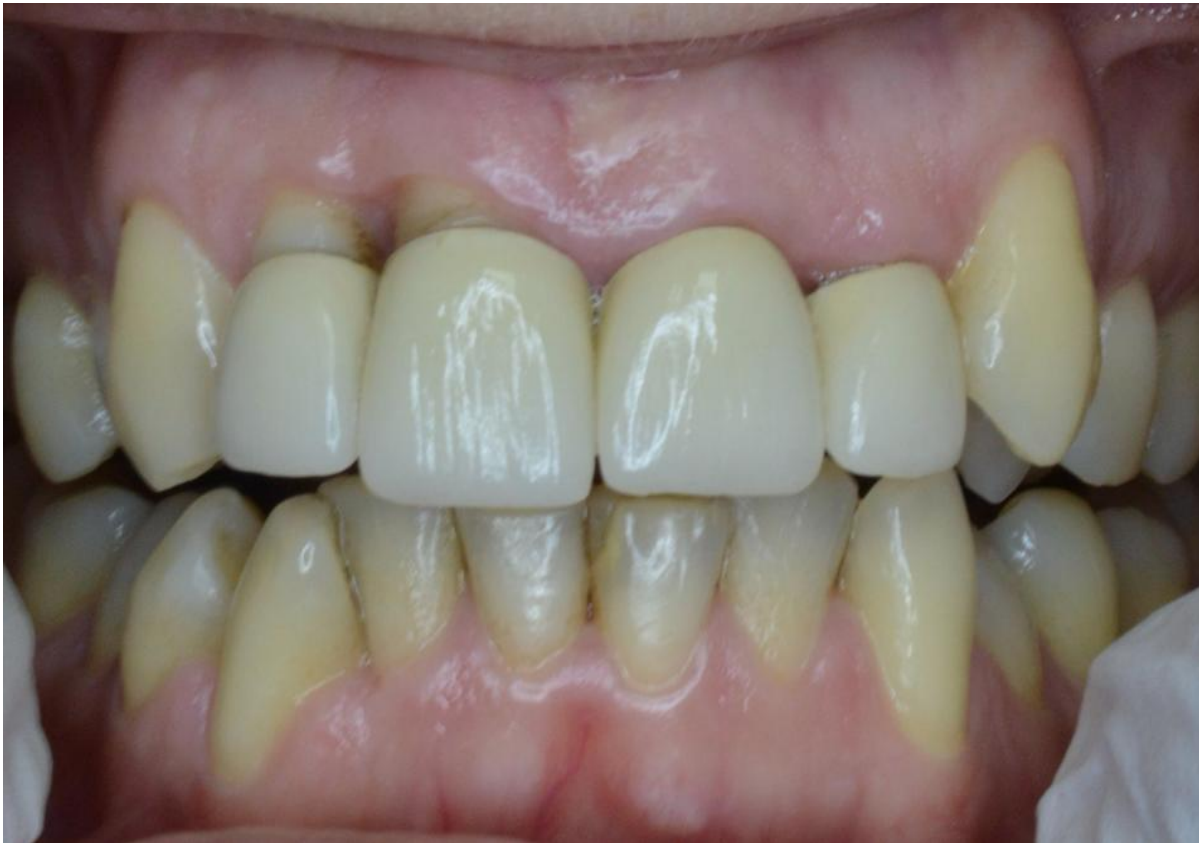
Figure 1. Initial pre-treatment photograph