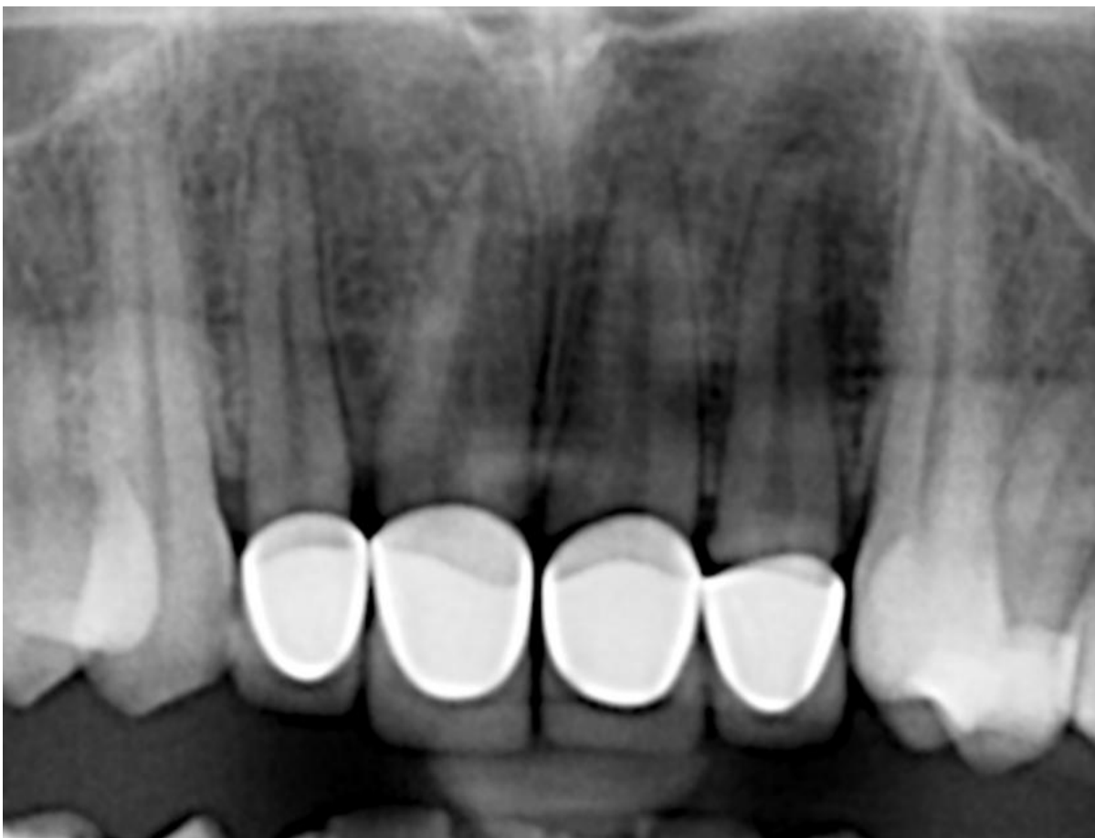
Figure 2. Pre-treatment radiograph