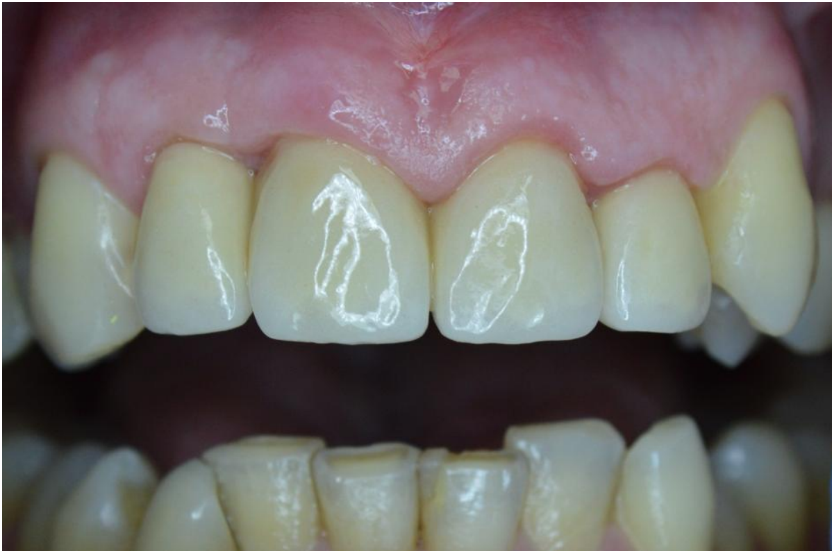
Figure 4. Photograph at one year follow-up